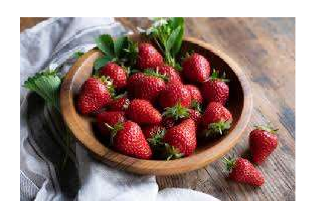
Tea & Coffee with Strawberry Tarts, Fruit Loaf, Shortbread Various Stalls and children activities Tickets: Adults £3, Children 50p